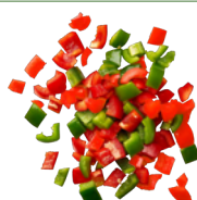
Pepper mix Pepper green, pepper red