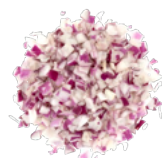
Diced red onions