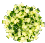
Cucumber Cucumber cubes