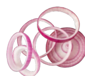
Red onion rings