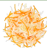
Coleslaw White cabbage, carrots