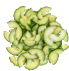
Cucumber Sliced cucumber