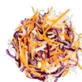
Raw salad Carrots, white cabbage, red cabbage