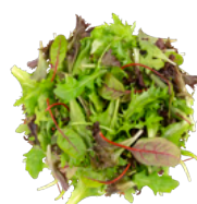
Young leaf lettuce mix Beet leaves, rocket, baby leaves red, baby leaves green