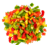
Pepper mix Pepper yellow, pepper green, pepper red