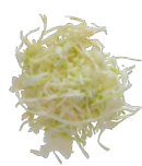
Sliced white cabbage