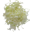
Sliced white cabbage