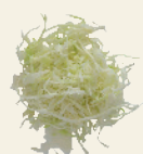
Sliced white cabbage