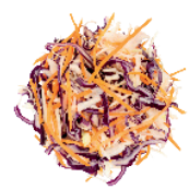
Raw salad Carrots, white cabbage, red cabbage