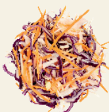
Raw salad Carrots, white cabbage, red cabbage