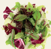
Lettuce mix Bachata Iceberg lettuce, batavia lettuce, lollo rosso, babybeet leaf, red lettuce, frisee