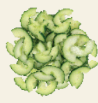
Cucumber Sliced cucumber