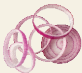
Red onion rings