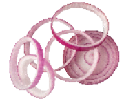
Red onion rings