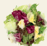
Lettuce mix Bari Lollo rosso, red lettuce, frisee, iceberg lettuce