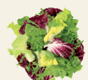
Mambo salad mix Scarole (broad-leaf endive), red lettuce, frisee