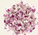
Diced red onions