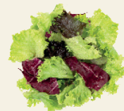
Basic mix Lollo bionda, lollo rosso, oakleaves red, red lettuce