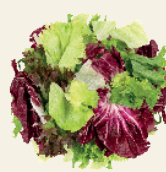
Show mix Lollo rosso, red lettuce, frisee, iceberg lettuce, scarole, lollo bionda