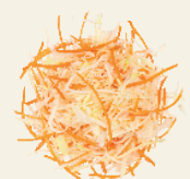
Coleslaw White cabbage, carrots