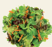
Lettuce mix Lollo rosso, lollo bionda, carrot, lamb's lettuce