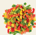
Pepper mix Pepper yellow, pepper green, pepper red