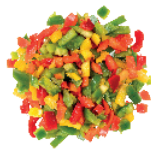
Pepper mix Pepper yellow, pepper green, pepper red