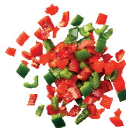
Pepper mix Pepper green, pepper red