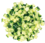
Cucumber Cucumber cubes