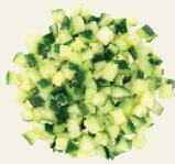
Cucumber Cucumber cubes