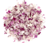
Diced red onions