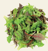
Young leaf lettuce mix Beet leaves, rocket, babybeet leaf/red/green