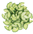
Cucumber Sliced cucumber