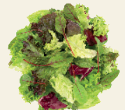
Gourmet salad Lollo bionda, lollo rosso, oakleaf lettuce red, red salad, beet leaf