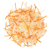
Coleslaw White cabbage, carrots