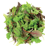
Young leaf lettuce mix Beet leaves, rocket, baby leaves red, baby leaves green