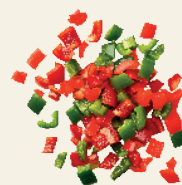
Pepper mix Pepper green, pepper red